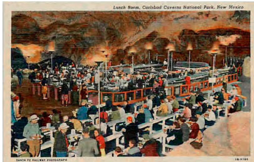
Café in Carlsbad Cavern, Post Card C1940s