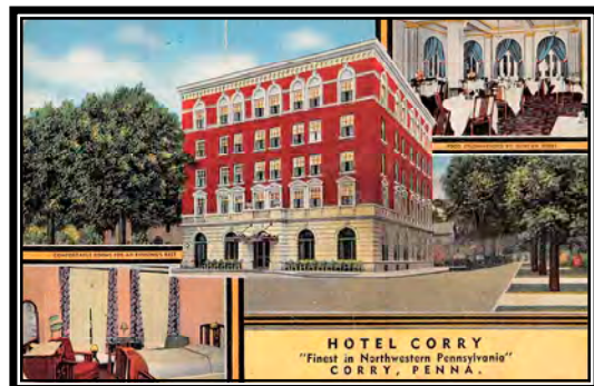
Hotel Corry, Post Card, C1930s

On March 3 there was one of our good old time blizzards, when, within a few hours, so much snow came down that all roads were blocked, and one could scarcely get out of their houses. The Highway Patrol had stopped all cars from leaving town, so there was nothing for me to do but wait around. On the following day, late in the afternoon they told me that it might be possible for me to