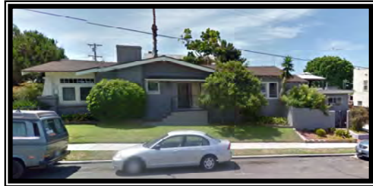
2912 Juniper Street, C2016