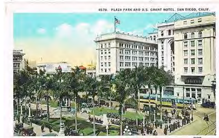
U.S. Grand Hotel (Right), San Diego, CA Post Card, C1940s

Eventually, that day, I drove through the Imperial Valley and came through La Mesa and late in the afternoon arrived in downtown San Diego and went at once to the U. S. Grant Hotel, the end of my journey, and the end of 3422 miles of all kinds 3 of driving without one single untoward event, no flat tires, no engine trouble, and from snowbanks at one end, to miles of orange groves and palm trees at the other end. Surely God had been good to watch over me on this most important trip, and if there were those of my beloved friends and relatives who prayed for my safety and welfare, their prayers were answered in full, and I was duly grateful.