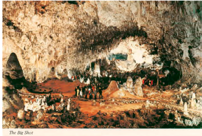
The "Big Shot" Room, Post Card C1940s

I am ahead of my story to the extent that I failed to mention my stop at Carlsbad, New Mexico, to see the famous Carlsbad Caverns.