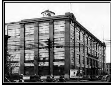
Kahn Tailoring Co., Indianapolis

Tailoring Company. I have been wearing their clothing for years, and always have wanted to see how they make up the clothes in a big plant like that. I had an idea that they just tool: the measurements as they came in, in the mail, and then picked out a suit that had been already made up, and came as near to the measurements in the order as possible. I never was more wrong. I went through the entire plant, and saw every process from the time the woolens are received, inspected, shrunk, etc., until they come out as finished suits. About 500 suits a day are made, and every suit is made according to the individual order. It was a great eye-opener to me and I wouldn't have missed it for anything.